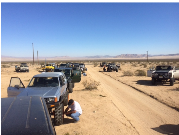
A beautiful sunny day to air down