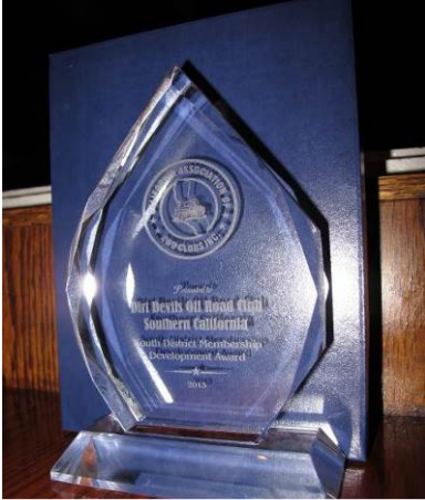
CAL 4 Wheel Drive, new member award